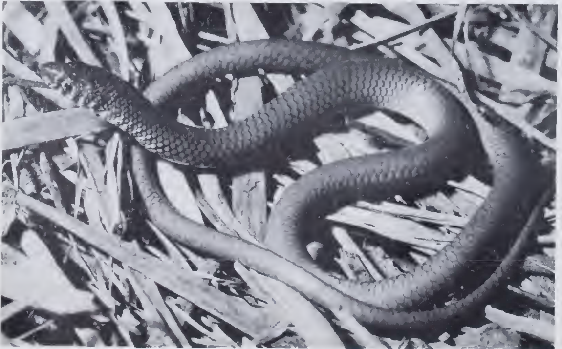
Figure 1 Holotype of Delma butleri , photographed in life by G. Harold.

A small Delma without dark or pale bands across top of head and neck. Distinguishable from D. nasuta by fewer and differently patterned loreals, shorter and darker snout, dark brown upper labials variably marked with white (rather than brownish white, narrowly edged above with dark brown), dorsals dark brown finely edged with blackish (rather than pale brown, spotted dark brown) and ventrals and subcaudals never dark-edged. Distinguishable from D. grayii